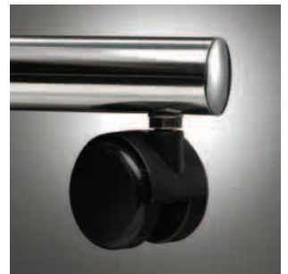
Castors fitted as standard