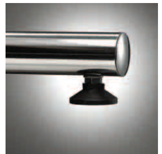
Adjustable glide fitted as optional extra. Please specify with order.