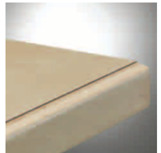
25mm Hardwood leading edge (standard). Other edges are available on request