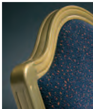
Siena tube detail. Please specify tube type with order