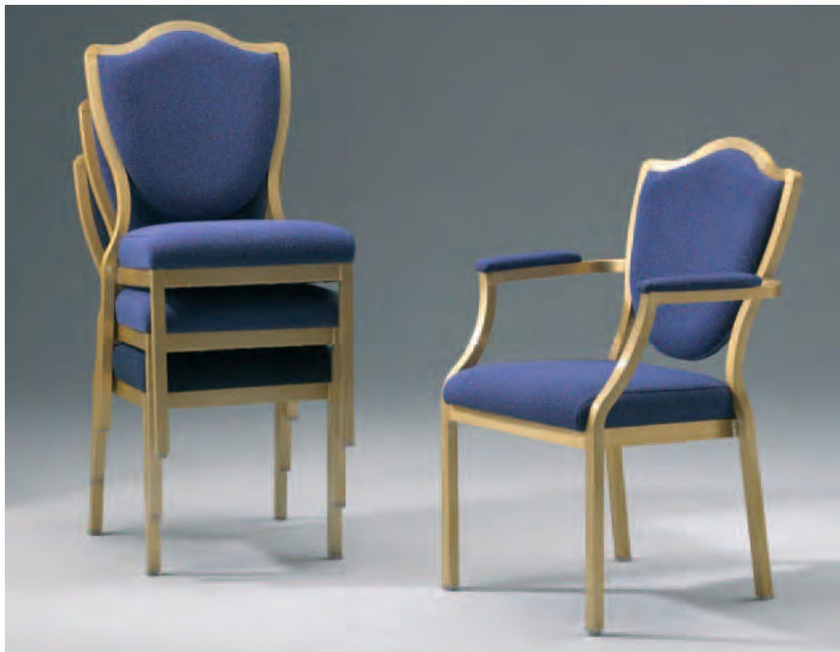
Salon 95/9 & 95/9A, All models stack 6 high