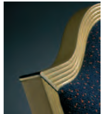
95/11, Cast corner detail available in gold, chrome or self colour. Please specify with order.