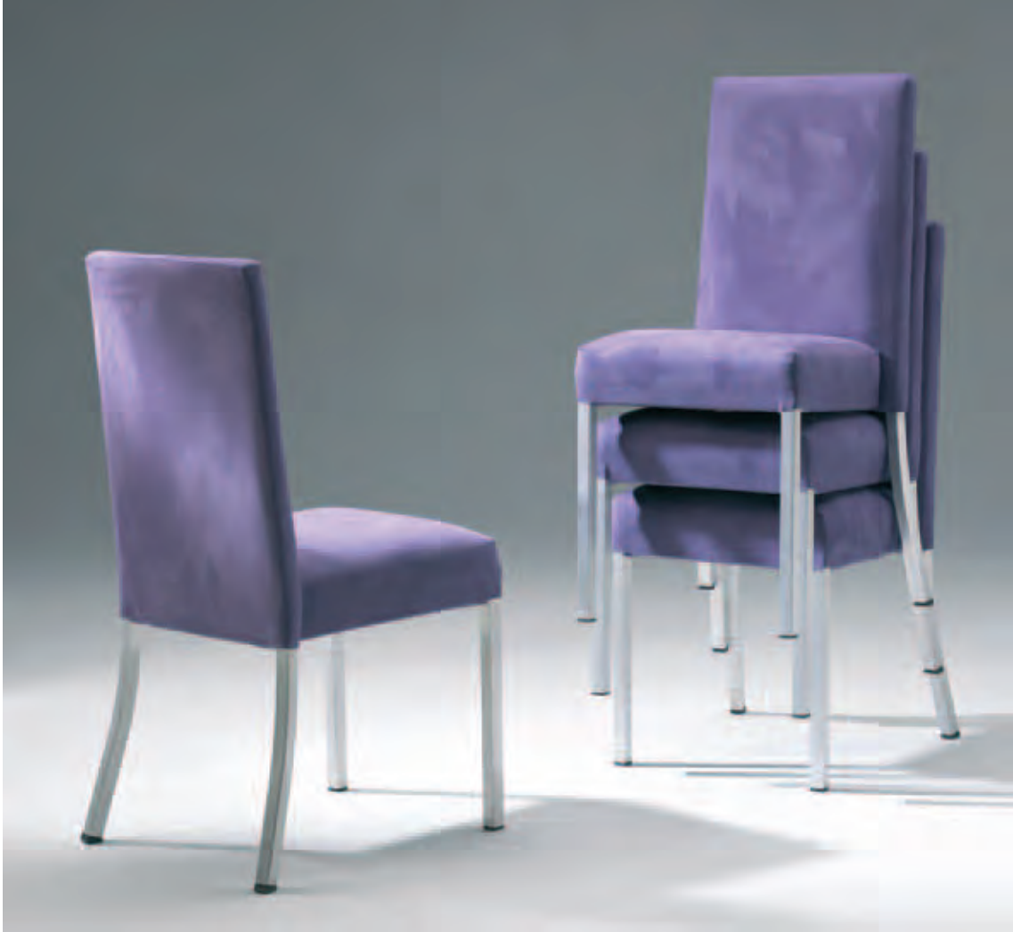
Kilo 64/1, stacks 4 high.