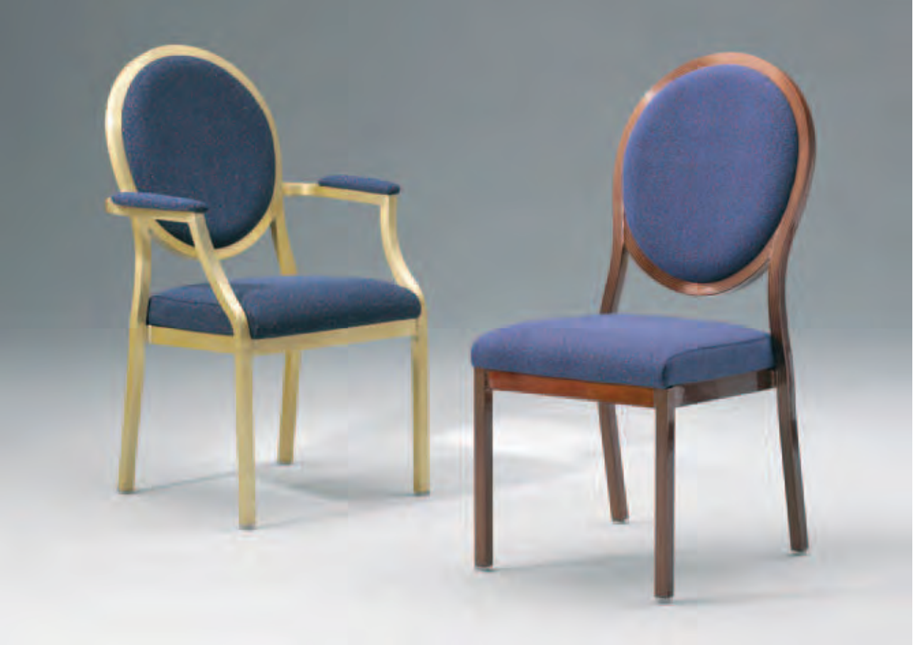
Salon 95/10A & 95/10